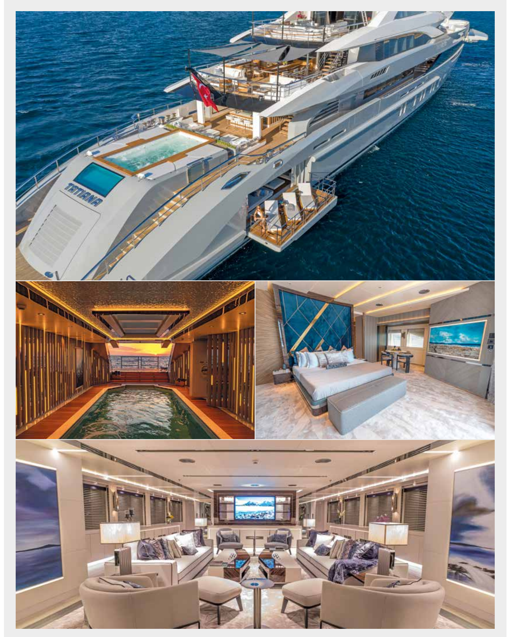
Turkish yard Bilgin significantly increases its superyacht credentials with the impressive 80m Tatiana. Sister ships are on the slips

Builders taking part include Ab Yachts, Abeking & Rasmussen, Alia, Arcadia, Azimut, baglietto, Baltic, Benetti, Bilgin, Clumbus, Conrad, CRN, Damen, Delta, Extra, Feadship, Ferretti, Fincantieri, Gulf Craft, Heesen, Icon, ISA, JFA, Kusch, Latitude, Lloyd Werft,