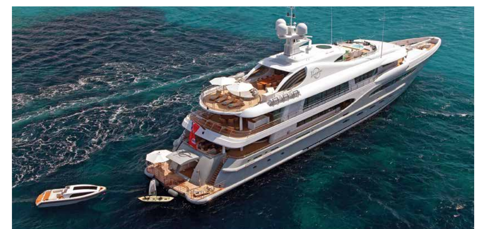
Earlier this year, Burgess led the sale of the 66m Amels Ventum Maris, formerly Imagine