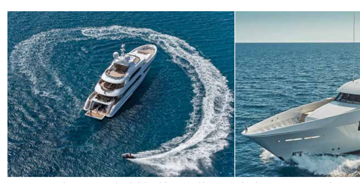
The 46m Heesen Book Ends (left) and the 44m Feadship Moon Sand (right) are among transactions by Burgess' Asia team in 2021