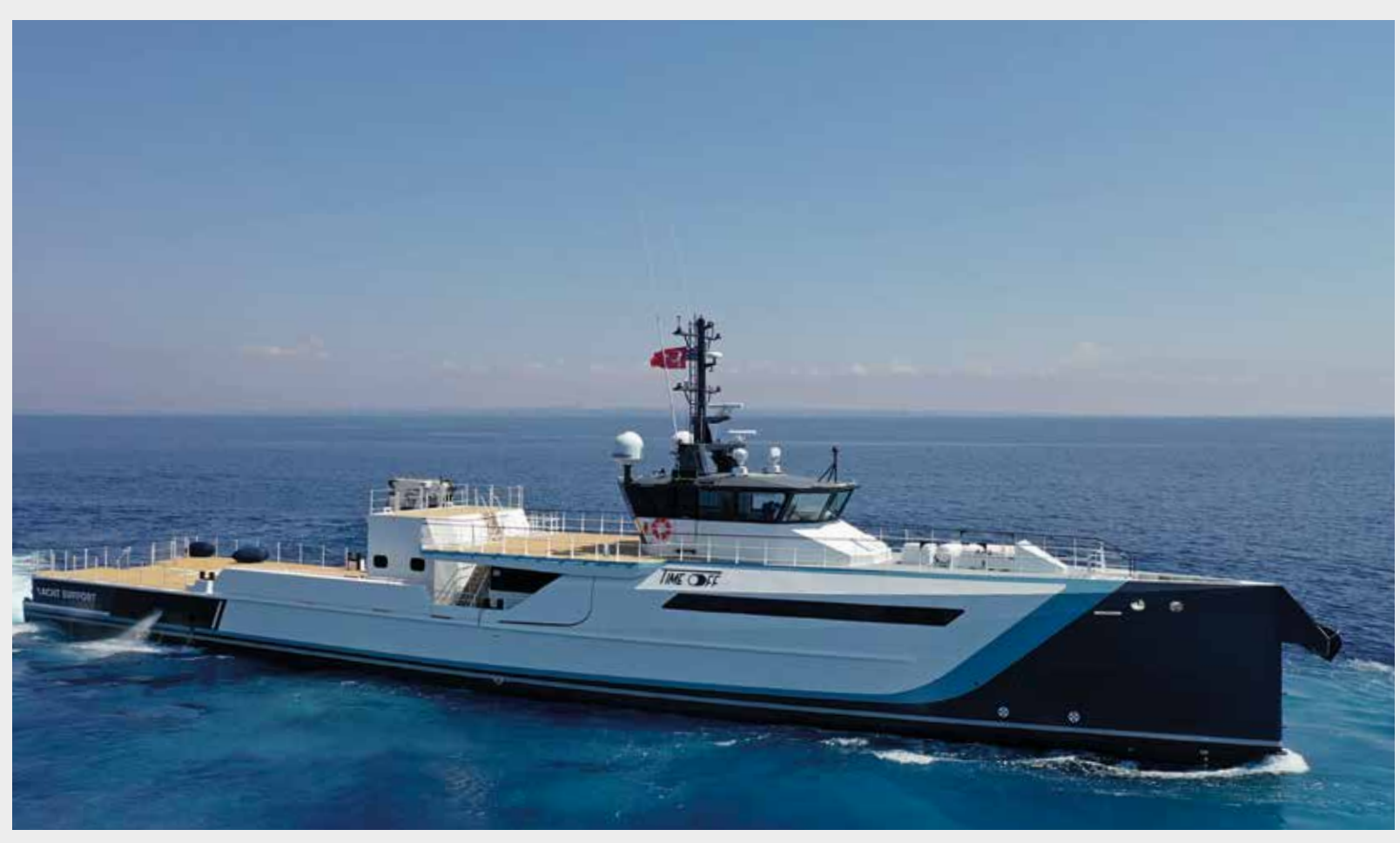
Damen Yachting's Time Off. The yard has so far built nine of these versatile Yacht Support vessels. See also Guest Columns this issue