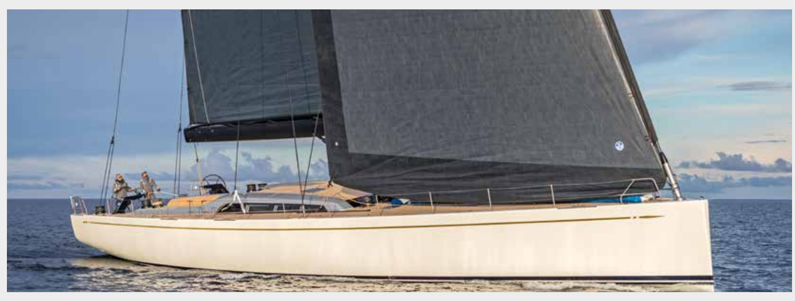
The sleek Swan 98 is among the largest sailing boats being displayed at Port Canto, which is home to both sailing monohulls and catamaran.

are among world premieres, while Australia's Riviera will show a 39 Open Flybridge, 54 Enclosed Flybridge and 6000 Sport Yacht Platinum Edition.