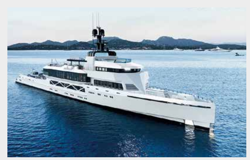
Silver Yachts' Australian-built 85m luxury explorer Bold

Other complementary sectors include Tenders and Toys on Quai Antoine, luxury cars on the car deck, luxury products as usual in the Parvis Piscine pavilion, and nautical gear and latest tech releases on Darse Sud and Quai Albert.