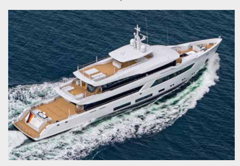
Asia-Pacific interest is high in the debut of this 55 m from Lürssen

On Quai L'Hirondelle, a focus is now on super sailboats, as well as their shipyards, designers and specialist equipment suppliers such as sails, spars and deck hardware. This sounds logical, but some clients are interested in both sail and motor yachts, and separating