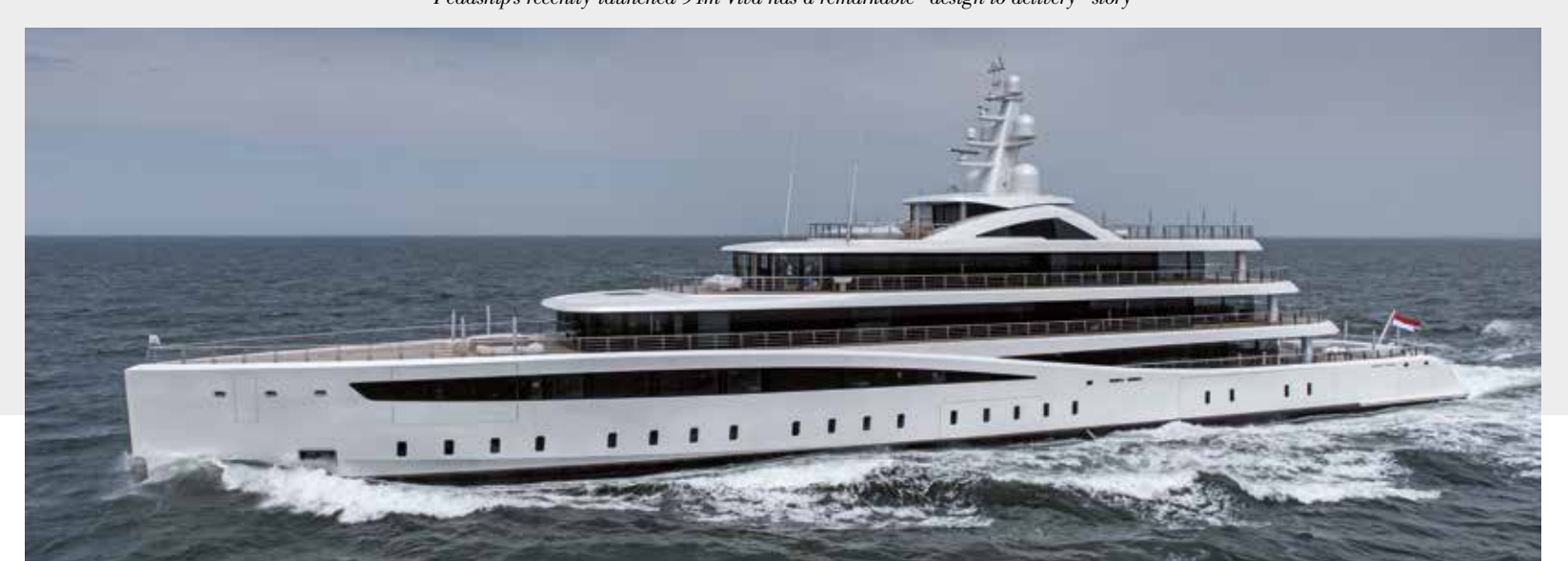
Feadship's recently-launched 94m Viva has a remarkable "design to delivery" story