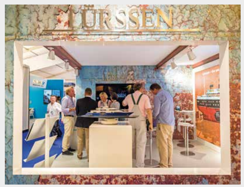
Builder bases in the pavilions provide links to vessels displayed outside

WORDS BRUCE MAXWELL