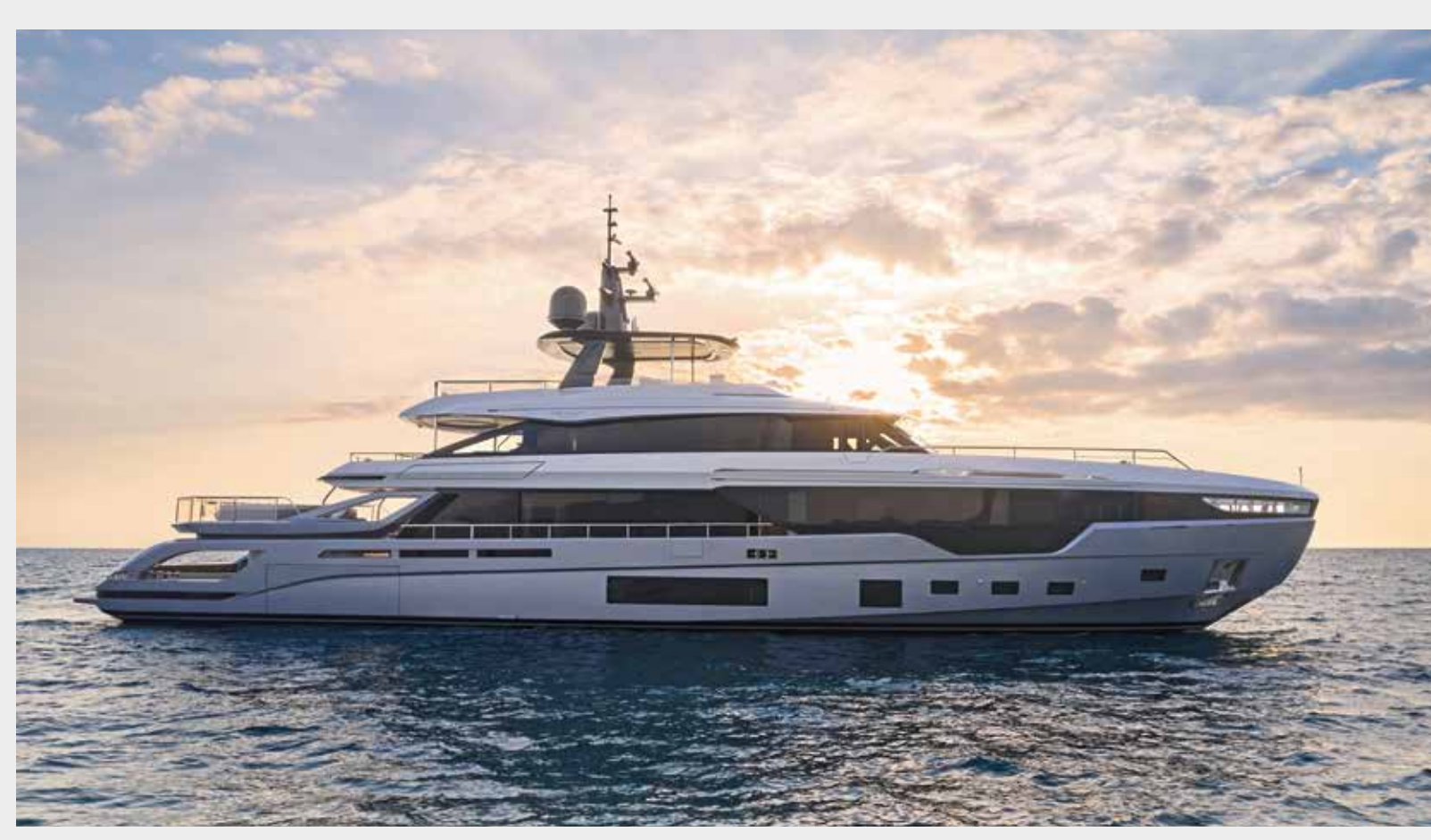
The Azimut Grande Trideck, the Italian builder's new 38m flagship, is among the largest world premieres at this year's Cannes Yachting Festival

X96 Triplex, Mangusta models include the 104 REV and GranSport 33 and Turkey's Numarine will debut its 37XP.